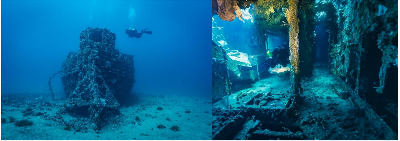
AV Ulonga and EXHAMS double dive trip