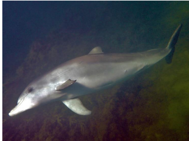
1-Spotted on a boat dive out from Port Victoria.

2020 threw us a curve ball, with COVID-19 halting usual activities and delaying the AGM from March to August. A massive thanks to the current committee who stayed on to help the club navigate unfamiliar waters and stay afloat. Activities are returning to a new kind of normal; boat dives have resumed, and a trip to Coobowie has successfully taken place, with more planned.