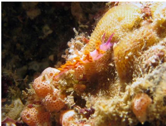
Orange Tipped Flabellina Nudibranch at The Gap (Matt Gibbs)

Having less than two boat loads of divers meant that the day was much more relaxed than usual, and after a bit of time at Cable Bay to change tanks and have some lunch it was around to the Gap for the second dive of the day. Conditions were similar to the rest of the weekend, but with its many swim-throughs and colourful growth the Gap was still as enjoyable as ever. The regular Blue Devils were seen in abundance, lots of little nudibranchs, along with another crayfish for the pot and more abalone. The crayfish was cooked up Sunday night and shared around, much to Rob's delight!