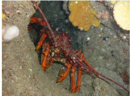
Crayfish at Althorpes, before...

way to cap off another successful Easter trip for the AUSC.