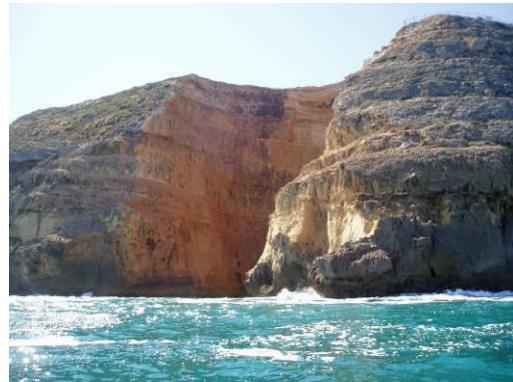
The Gap (Verity Bone)

before, it was starting to look like another jetty dive might be the order of the day. After another survey of the water Mostyn decided it wasn't really that bad, which was all it took to get two boatloads of divers to head out to the inside of Haystack Island. Conditions were still challenging, with visibility below 5m, but there were lots of little jellyfish in the water to provide some entertainment.