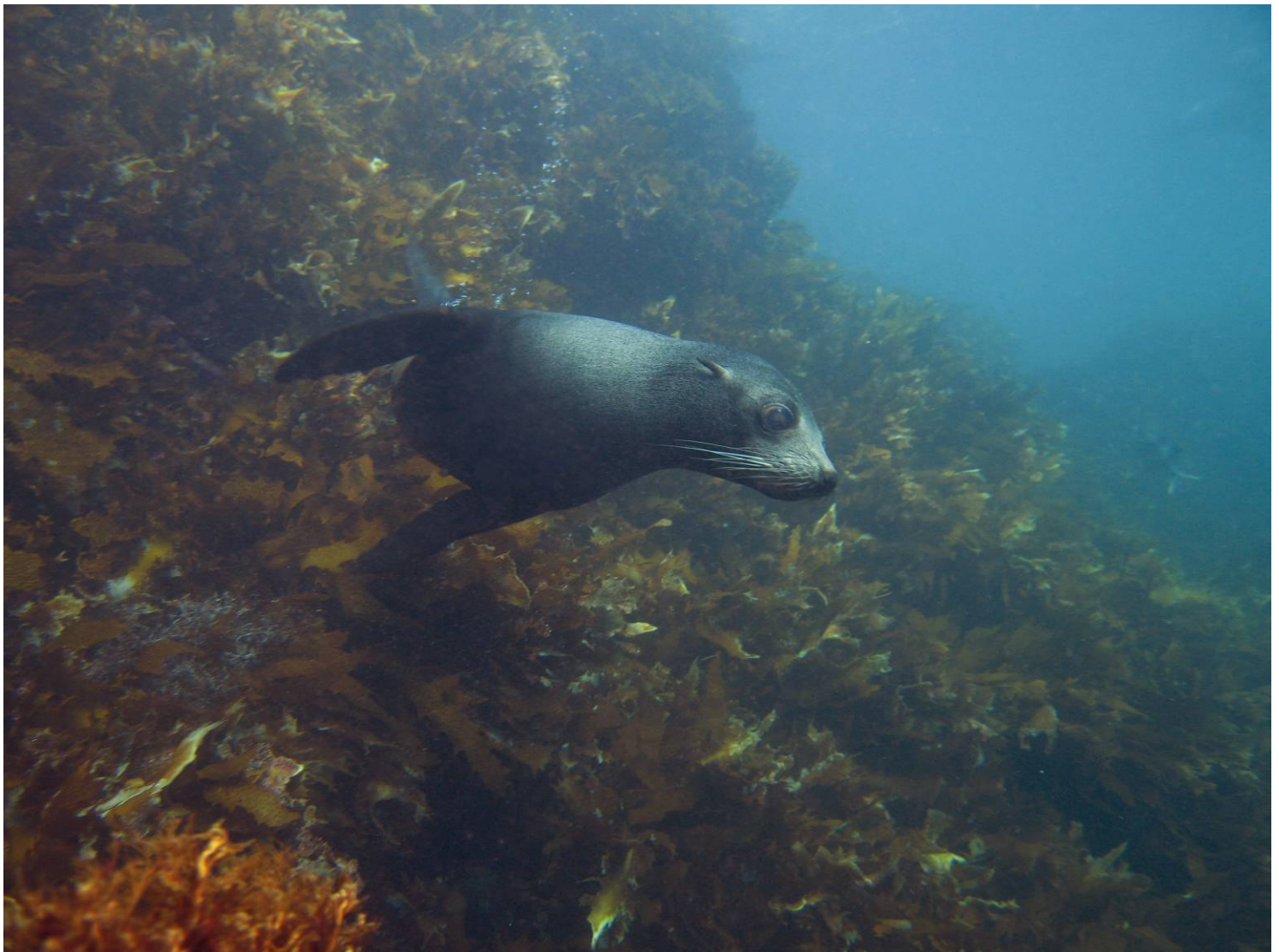
Fur Seal at Althorpe Island, by Matt Gibbs