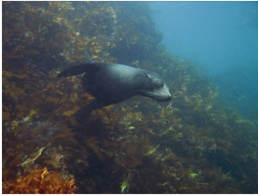
Fur Seal at Althorpe Island (Matt Gibbs)

Having less than two boat loads of divers meant that the day was much more relaxed than usual, and after a bit of time at Cable Bay to change tanks and have some lunch it was around to the Gap for the second dive of the day. Conditions were similar to the rest of the weekend, but with its many swim-throughs and colourful growth the Gap was still as enjoyable as ever. The regular Blue Devils were seen in abundance, lots of little nudibranchs, along with another crayfish for the pot and more abalone. The crayfish was cooked up Sunday night and shared around, much to Rob's delight!